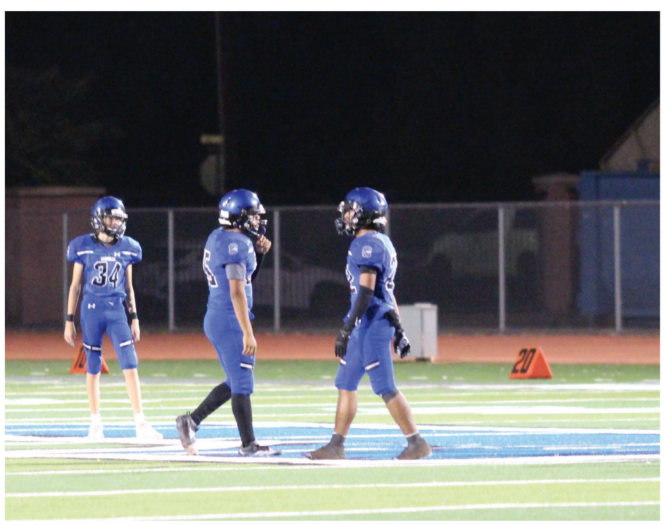
Freshman Boys Football at Basha High School on October 23, 2024.