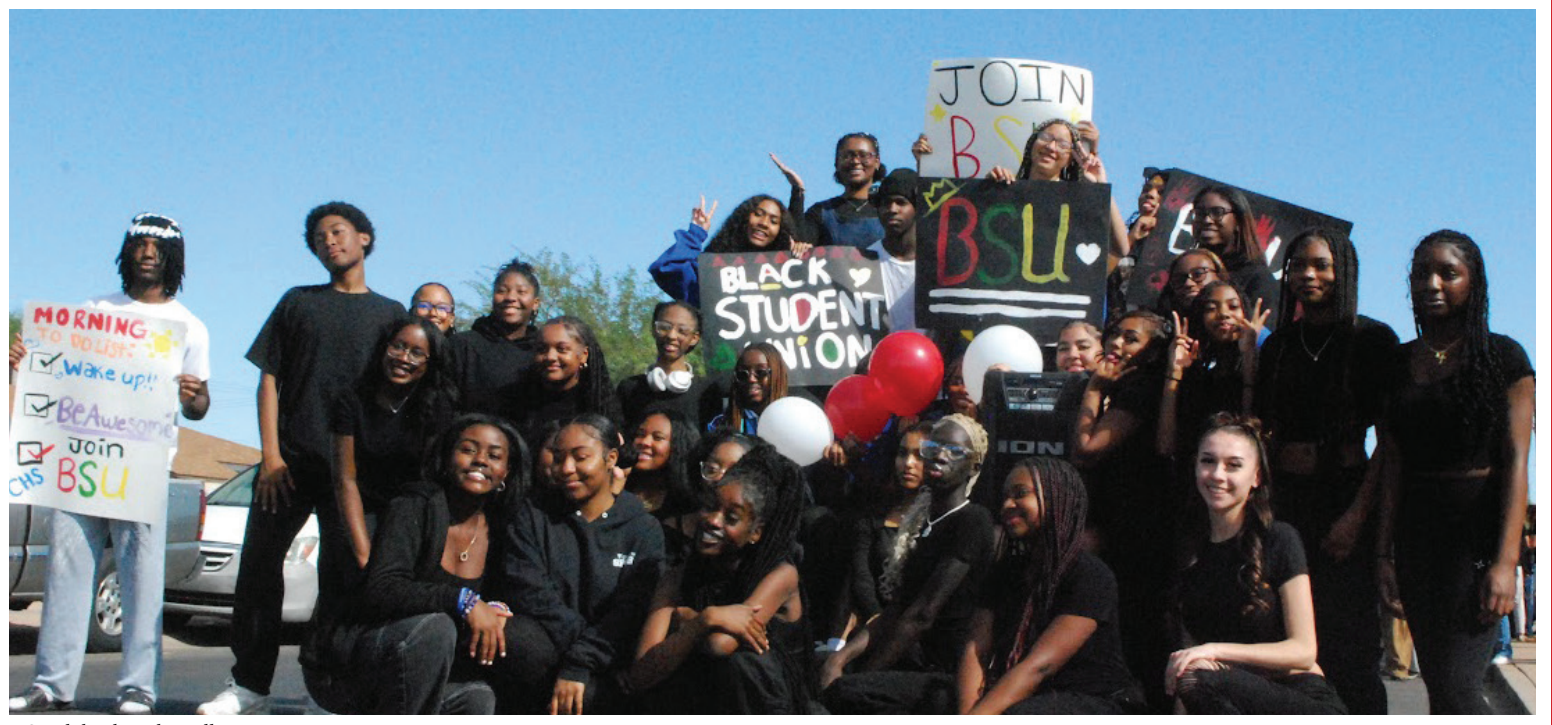
BSU club

Although Chandler High School has many treasured Homecoming season traditions, new students may have many questions. Who created the first Homecoming parade? When did we start holding a parade? Why do we continue this tradition year after year? The lore of the CHS Homecoming Parade is deep, and we set out to dig into the details.